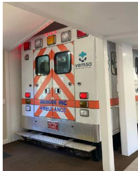
Training Center Simulation Ambulance

Some portion of the federal Covid funding, which was being appropriated into states to try to mitigate the loss of life and the overwhelming suffering of the pandemic, came to Rescue Inc because of these actions. Knowing that COVID response revenue was not a sustainable income generator, but rather a one-time influx, Rescue Inc's leadership, staff, and board considered how best to use this federal funding. Rescue Inc is proud to announce that those funds have allowed us to open the Vermont EMS Academy (VEMSA). This ground-breaking academy is committed to providing the most state-of-the-art training for emergency healthcare and supports the dire need to increase the EMS workforce in Vermont and beyond. The training facility, located in Newfane, serves three vital communities. The first is Rescue Inc's local community where medical providers and other educators can learn the newest and most effective techniques. The second community is that of our State and the region, where there is a lack of emergency medical training opportunities that are vital due to the rural nature of this state and how far many of its citizens are from hospitals and clinics. Finally, this facility is serving our National EMS family, which has been particularly hard hit in the recent labor shortage, by providing access to lifesaving education. Our goal, ultimately, is to improve the lives and health of people through quality education resulting in better health outcomes.